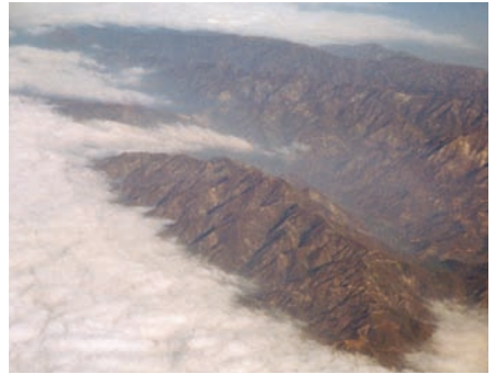
Clouds collect on the Sierra Nevada.

The drops will keep growing if you take the light away and let the dome cool. When the drops are large enough, they will run down the sides of the dome. Taste the water of condensation. Is it still salty? If your experiment were to run long enough, all the water would evaporate and the salt would remain behind in the petri dish. This technique can be used in an emergency to make drinking water out of seawater. However, the evaporated and condensed water would lack important minerals.